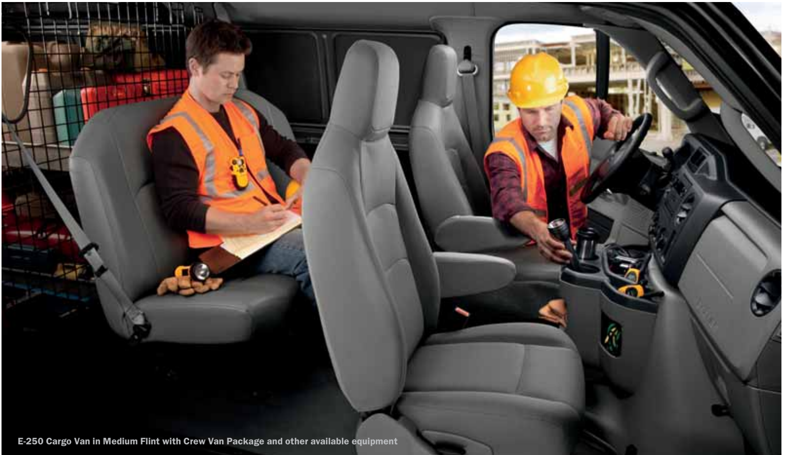
E-250 Cargo Van in Medium Flint with Crew Van Package and other available equipment

Equip your E-Series Cargo Van with the available CREW VAN PACKAGE to carry PEOPLE AND GEAR with ease. Up front, the roomy 2nd-row vinyl bench seat with 3-point, seat-integrated safety belts creates room for a CREW OF UP TO 5 . The seating area is finished similar to that of a Wagon with a partial headliner, full B-pillar trim panels, polypropylene side door-trim panels, a lower trim panel behind the driver's seat, and a convenient pull handle on the 40% portion of the side door. RUGGED VINYL FLOOR COVERING runs throughout the front and rear sections. A sturdy, METAL-MESH BULKHEAD divides the 2 spaces. And the passenger-side rear door gets a pull handle in the cargo area to help make quick work of equipment transfers.