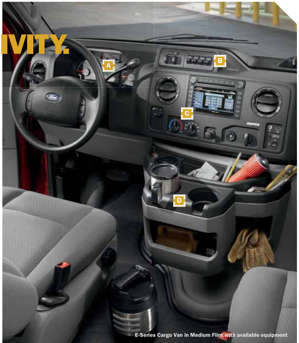
E-Series Cargo Van in Medium Flint with available equipment

This standard feature gives you lots of storage capacity within easy reach. The upright storage bin is large enough to hold clipboards or even some laptops.