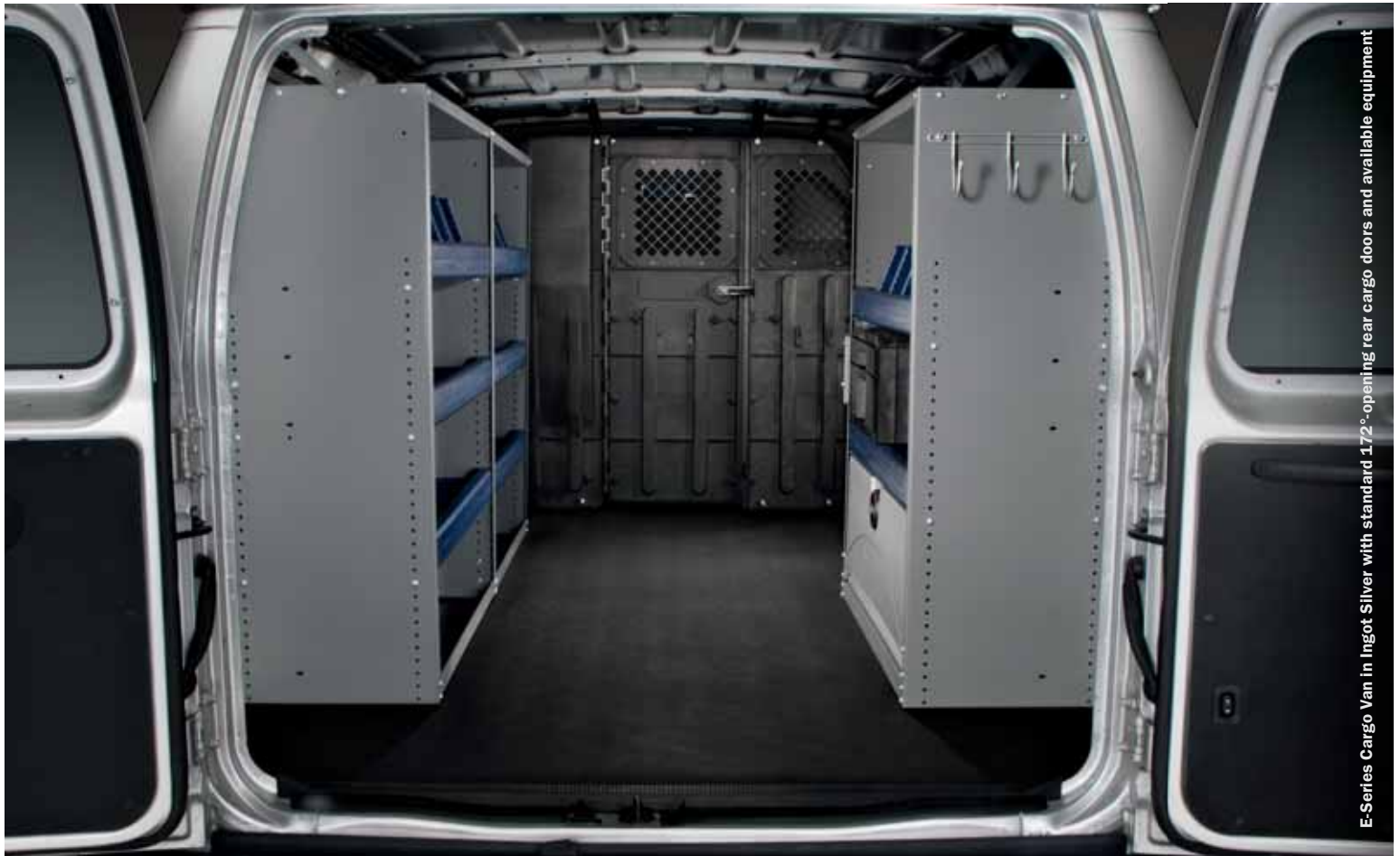
E-Series Cargo Van in Ingot Silver with standard 172" opening rear cargo doors and available equipment

A wide range of available STORAGE SOLUTIONS by Masterack® can help keep you organized. There's the QUIETFLEX® COMPOSITE racks and bins package, the rugged MASTERACK® STEEL racks and bins package, and the ECONOCARGO® Cargo Management System – all AVAILABLE AT NO EXTRA CHARGE ¹