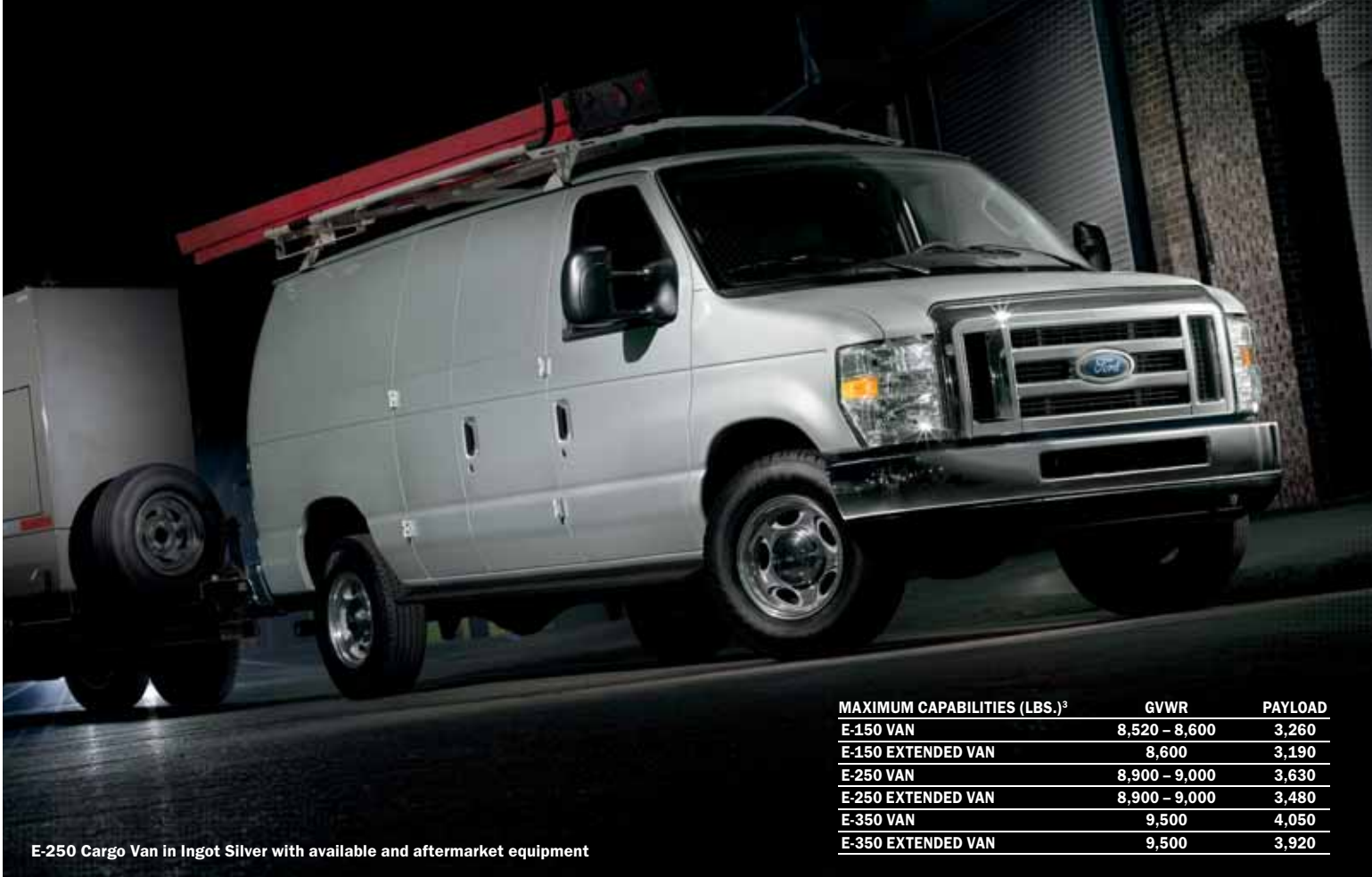
E-250 Cargo Van in Ingot Silver with available and aftermarket equipment

E-Series Vans can help you TOW UP TO 10,000 LBS. 1 with the confidence of SMART TECHNOLOGY like standard Roll Stability Control, TM an available integrated trailer brake controller, available full-color rear view camera and more. Standard DOUBLE-WALL CONSTRUCTION helps protect the outer body from shifting loads so you can HAUL UP TO 278 CU. FT. OF CARGO with peace of mind. Among your choices: 3 engine/transmission combinations including a TorqShift® 5-speed automatic with TOW/HAUL MODE 1 sliding or swing-out side cargo doors, windows all around or panel sides, NO-CHARGE RACKS AND BINS PACKAGES for easy stowing, and TRADE-SPECIFIC UPFITTER PACKAGES 2 E-Series is ready to meet your challenges.