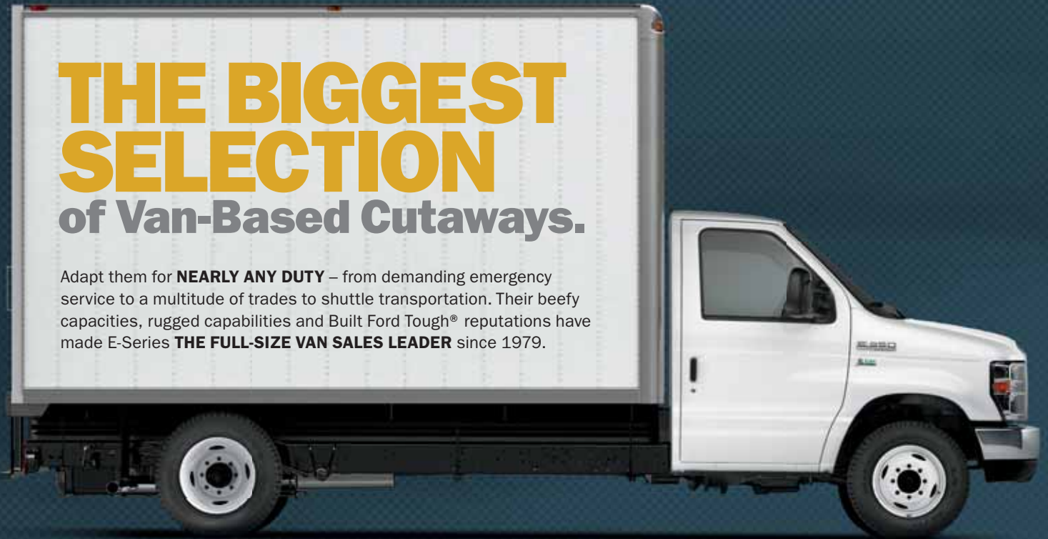
E-350 Cutaway in Oxford White with aftermarket Cube Van Upfit and available equipment

Adapt them for NEARLY ANY DUTY – from demanding emergency service to a multitude of trades to shuttle transportation. Their beefy capacities, rugged capabilities and Built Ford Tough® reputations have made E-Series THE FULL-SIZE VAN SALES LEADER since 1979.