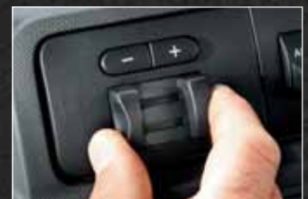
FACTORY-INTEGRATED TRAILER BRAKE CONTROLLER OPTION

AdvanceTrac® with class-exclusive RSC® (Roll Stability Control) 4 is standard on all E-Series Vans and Wagons this year. Working in conjunction with the Anti-Lock Brake System (ABS), traction control and yaw control, the system automatically determines when and how to apply individual brakes and modify engine power to help keep all 4 wheels firmly planted.